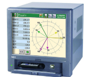
Analysers of network parameters ND1.