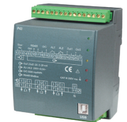
P43 - three-phase transducers of power network parameters.