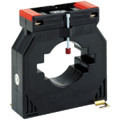
Current transformers from 5 A up to 6 kA.