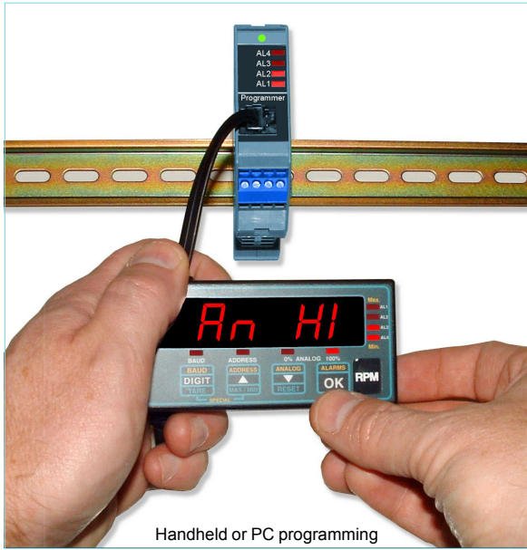
Handheld or PC programming